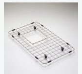
ACPSQ6 Bowl Protector