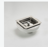
AC175Q Basket Waste