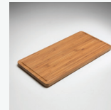
ACP124 Bamboo Board