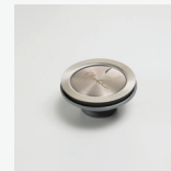
AC28 Basket Waste