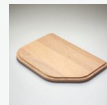
AC65 Bamboo Board

For more information call 1300 13 7465 or visit oliveri.com.au