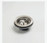
AC14 Basket Waste