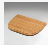
AC74 Bamboo Board