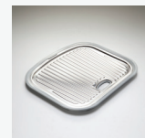
AC73 Utility Tray