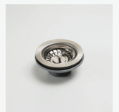
AC14 Basket Waste