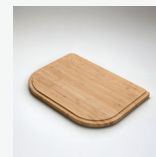
AC15 Bamboo Board