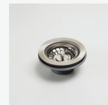
AC14 Basket Waste