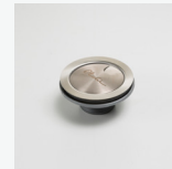
AC28 Basket Waste