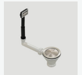
AC10 Basket Waste with Rectangular Overflow