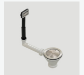
AC10 Basket Waste with Rectangular Overflow