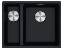
MRG160-34/15 SBL ON