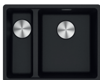
MRG160-34/15 SBL ON