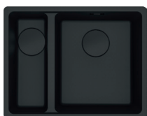
MRG160-34/15 SBL MB