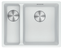
MRG260-34/15 SBL PW