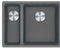
MRG260-34/15 SBL SG