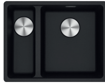
MRG160-34/15 SBL ON