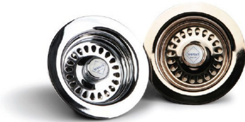
Shown above in Stainless Steel and Gold.